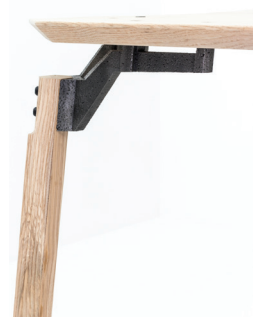
EPS TABLE casted iron different wood options different size options height 760 mm