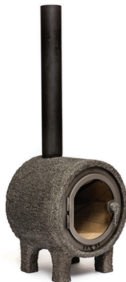
ROUND HAND-PEELED STOVE casted iron different color options 10.6 kW CE & NEN EN 13240 Smoke Exhaust: back or above 510 x 600 x 720 mm