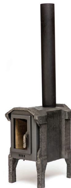
SQUARE CUT-OUT STOVE casted iron different color options 7.2 kW CE & NEN EN 13240 Smoke Exhaust: back or above 555 x 380 x 700 mm

Klaas is really interested in new materials and innovative manufacturing methods. Therefore, he regularly collaborates with initiators, co-designers and factories with cutting-edge products as a result. Are you looking for a collaboration with Klaas Kuiken? Please contact us!