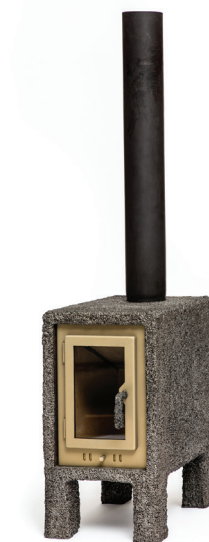
SQUARE HAND-PEELED STOVE casted iron different color options 7.2 kW CE & NEN EN 13240 Smoke Exhaust: back or above 555 x 380 x 700 mm