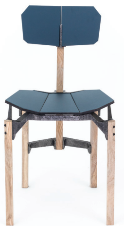
EPS CHAIR casted iron wood / forbo different color options 445 x 480 X 820 mm