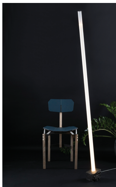
EPS LIGHT casted iron different color options