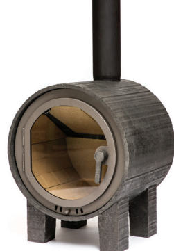
ROUND CUT-OUT STOVE casted iron different color options 10.6 kW CE & NEN EN 13240 Smoke Exhaust: back or above 510 x 600 x 720 mm